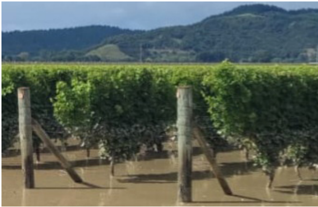
Vineyard where silt has been in the bunch zone and now sitting in wet silt