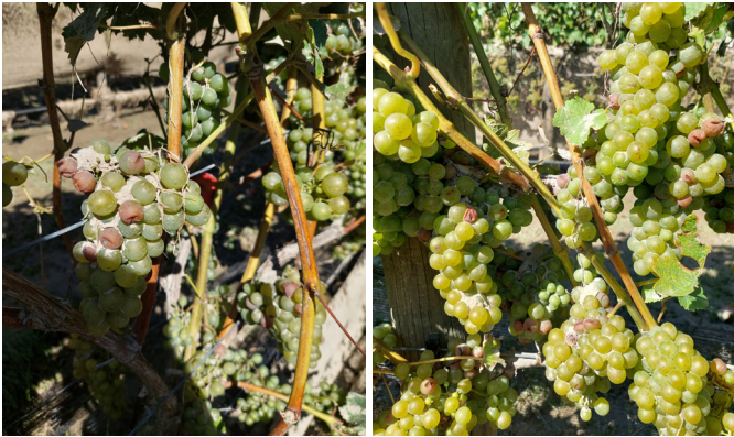
Silt through the bunches