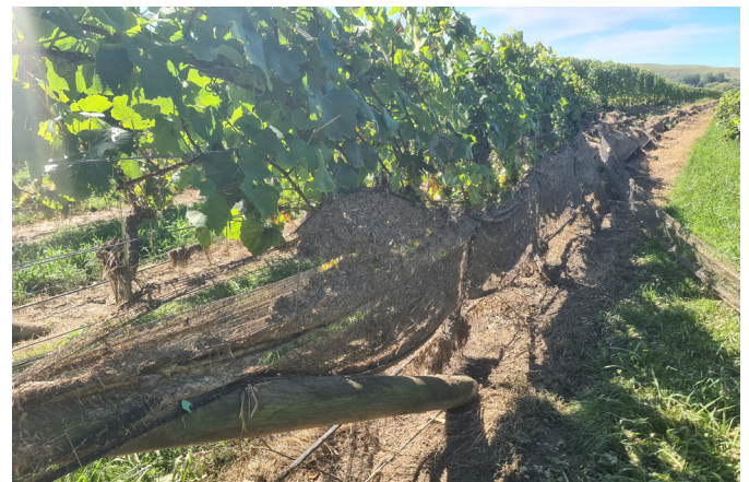
Nets after being in flood waters, remove netting